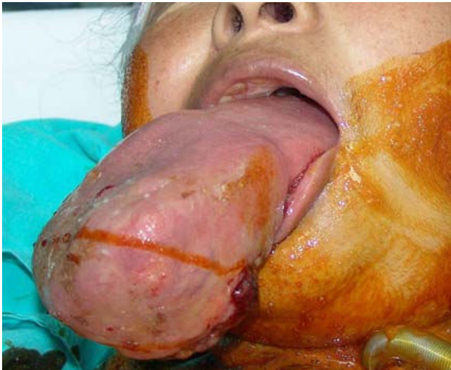
Figure 2 33 year old female with a massive infiltration of the tongue due to ACC.

of ACC, perhaps due to the slow growth rate of this neoplasm. In this respect, several agents have been proven with low rates of response, such as cisplatin, 5-fluorouracil, adriamycin and cytoxan, either alone or in combination [22].