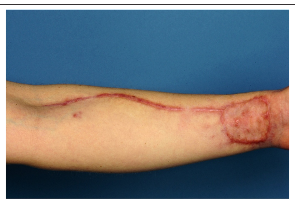
Figure 8 Lateral view 3 weeks post operatively.

improved survival rates will become more common as drug therapies improve.