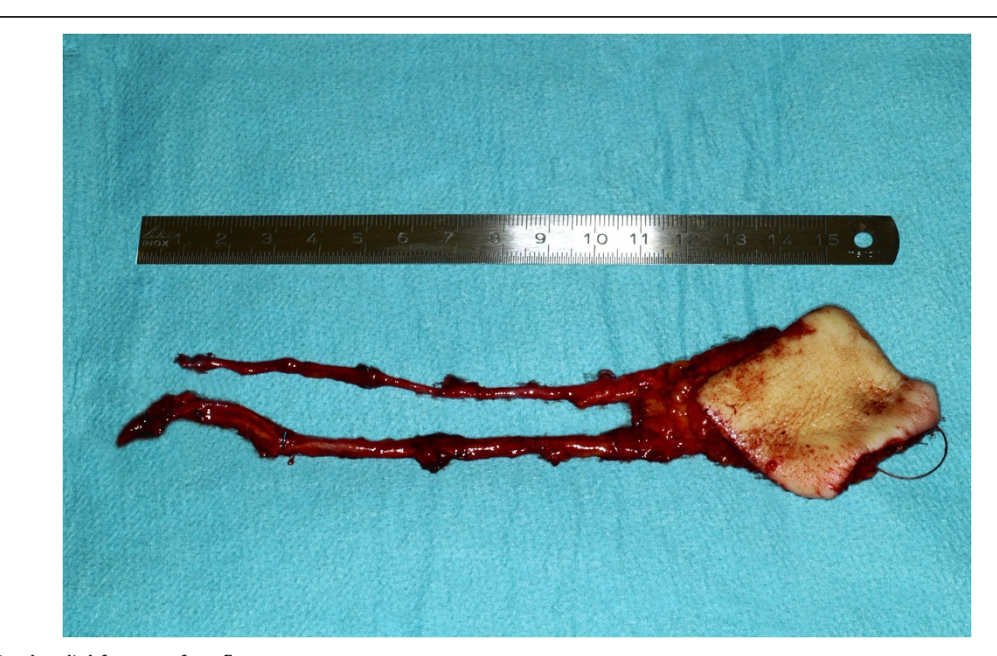
Figure 4 Raised radial forearm free flap.

malignant alteration and on the day of the first examination a biopsy under local anesthesia was performed. The histopathology showed a moderately differentiated, squamous cell carcinoma with surrounding chronic inflammation. The patient was transferred to the Cranio-Maxillofacial and Oral Surgery Division of the University Hospital Zurich. A MRI (Magnetic Resonance Imaging) as well as a PET (Positron Emission Tomography) scan was performed as per standard oncological staging. No