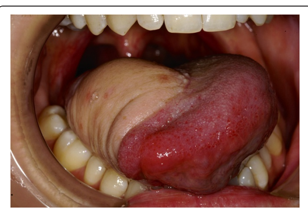
Figure 7 3 week post operative view showing good tongue mobility.