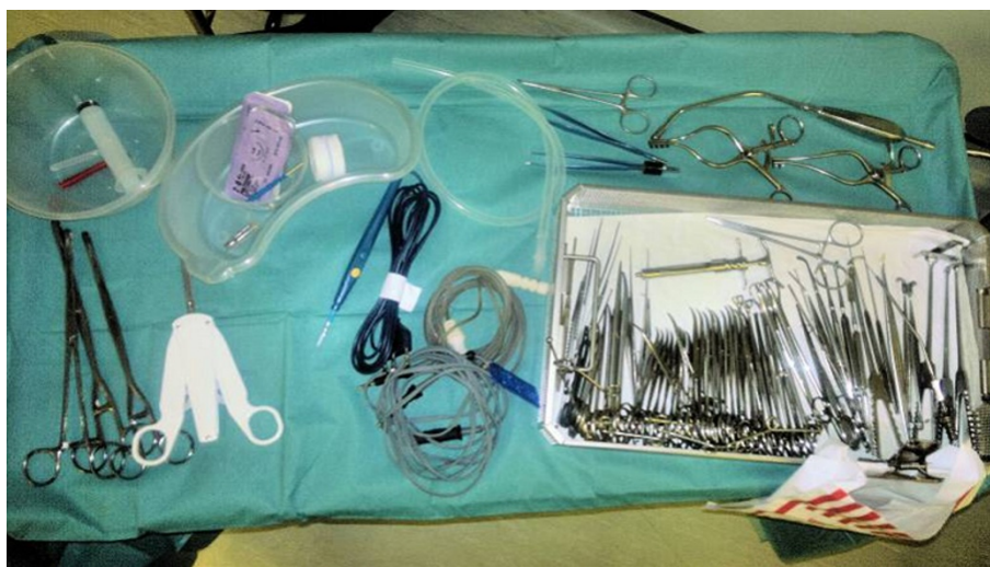
Figure 1 The instrument tray.

There are many arguments for and against nerve monitoring but despite knowing the anatomy and having done this procedure many times we still use the monitor and stimulator for every case but with a healthy scepticism of the results if negative. It is not unknown for the tracheo-laryngeal electrode to become displaced and give a false negative reading, similarly the unfamiliar anaesthetist may have used a temporary neuromuscular blocking agent or the local anaesthetic used may still have an effect. We use it to confirm surgical dissection only and to acquaint the team with its benefits and pitfalls through familiarity. To not use an aid when