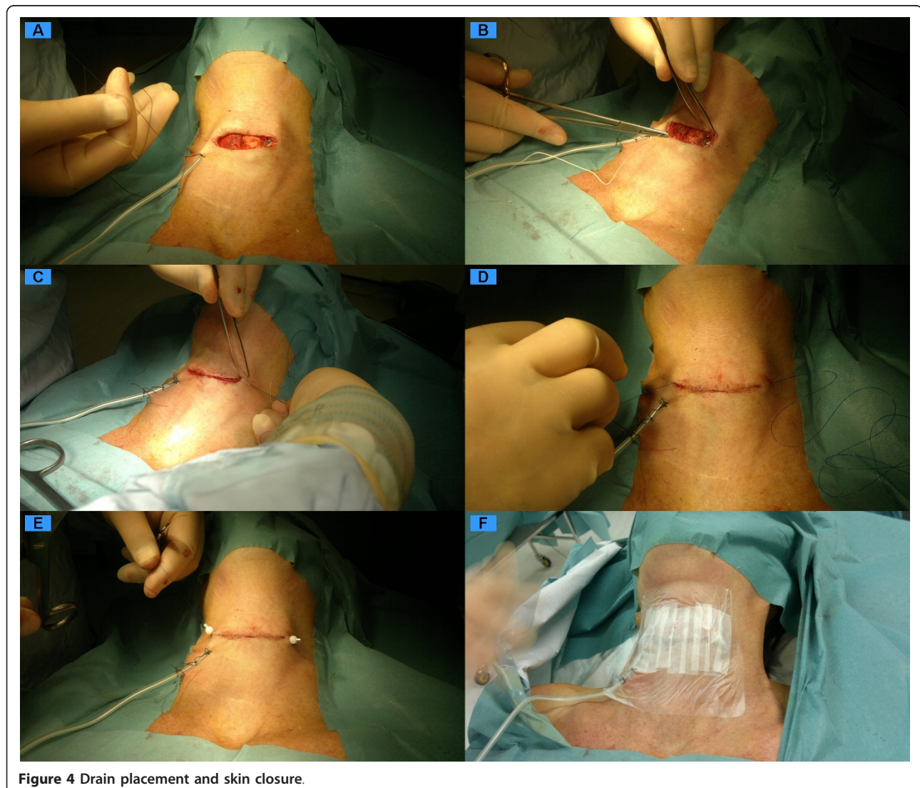
Figure 4 Drain placement and skin closure.

The infra-hyoid muscles if divided are re-approximated and only a few loose sutures are used to